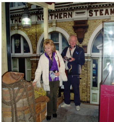
Sightseeing in NZ October 2008