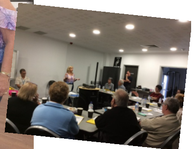
Above and below .. Attendees giving their full attention to the presenters.